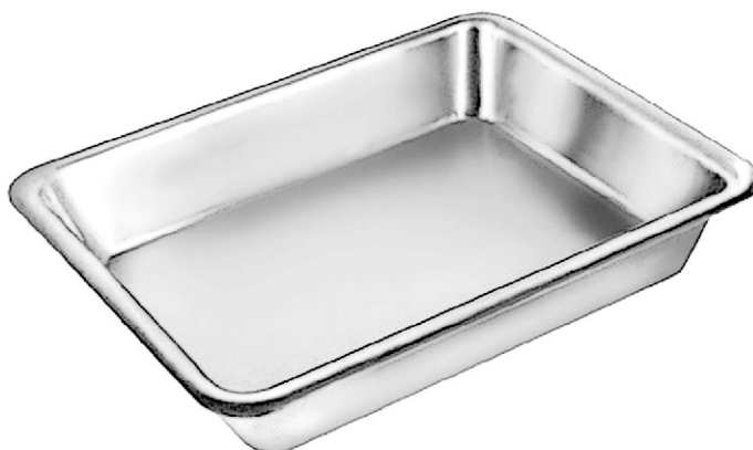
27-038-00 235 x 190 x 40 mm

L = Length W = Width D = Depth ø = Diameter