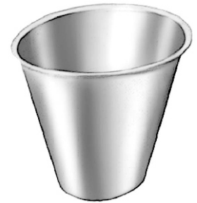
27-076-90 Ø 90 x 90 mm, height