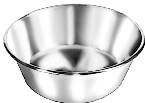
27-036-00 ø 200 x 70 mm