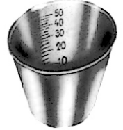
27-075-50 50 cc