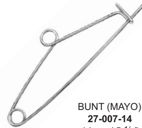
BUNT (MAYO) 27-007-14 14 cm / 5 1/2"