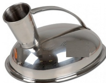
27-024-01 Urinal Bed Pan (male)