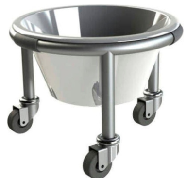
27-201-01 Bucket Kick Bowl-Stand