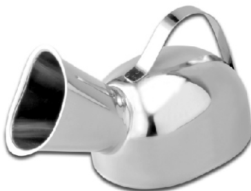
27-023-01 Urinal Bed Pan (Female)