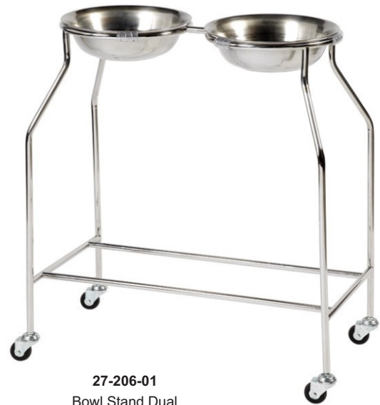
27-206-01 Bowl Stand Dual