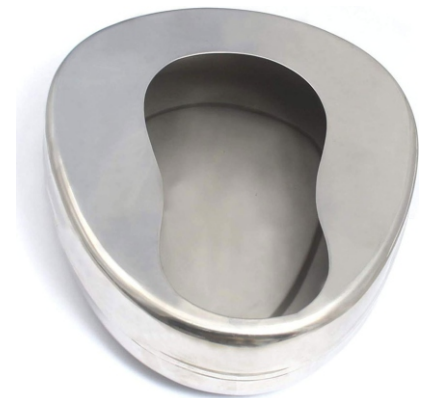
27-028-01 Bed Pan Stainless Steel