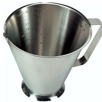
Measuring jug 27-077-10 1 Liter